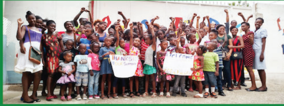
May 28, 2016, students and staff of the FEPE orphanage and EPE school in Port-au-Prince greet SUFC. Why are these people smiling? A great reunion!